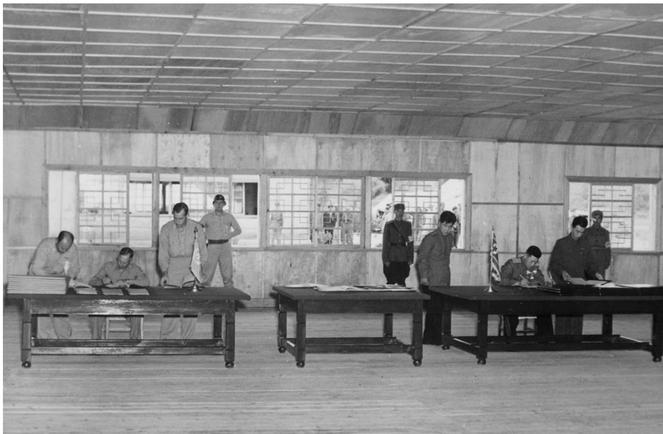
US Army General William K. Harrison, left, and North Korean General Nam Il sign armistice documents ending the three-year-old Korean conflict on July 27, 1953.

The type of instrument used to codify the final peace settlement could have important implications for diplomatic negotiations, long-term sustainability, and congressional-executive relations. The State Department's Office of the Legal Adviser is responsible for deciding how an international agreement should be classified based on criteria outlined under the Circular 175 procedure. 49 In practice, however, the decision is often a political matter, taking into account the likelihood of Senate approval. 50