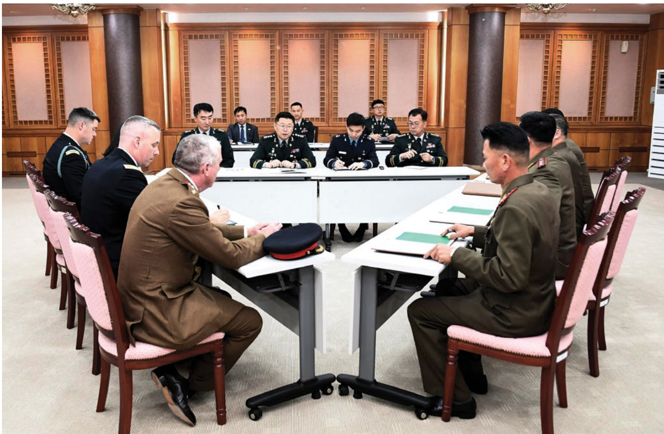
Military officers from the US-led United Nations Command, South Korea, and North Korea (clockwise from left) attend an October 16, 2018 meeting in the Demilitarized Zone to discuss efforts to ban weapons in the border village of Panmunjom.

monitoring and preventing North Korea’s illicit ship-to-ship transfers), and would manage force flows in a contingency scenario. 136 In recent years, the UN Command has undergone a formal “revitalization” process to strengthen the role of sending states in a potential crisis. 137 The Moon administration has expressed concern, however, that Washington could use the UN Command to maintain control over the Combined Forces Command and ROK forces during a military crisis, even after the transition of wartime operational control, by defining the situation as a violation rather than nullification of the armistice. 138