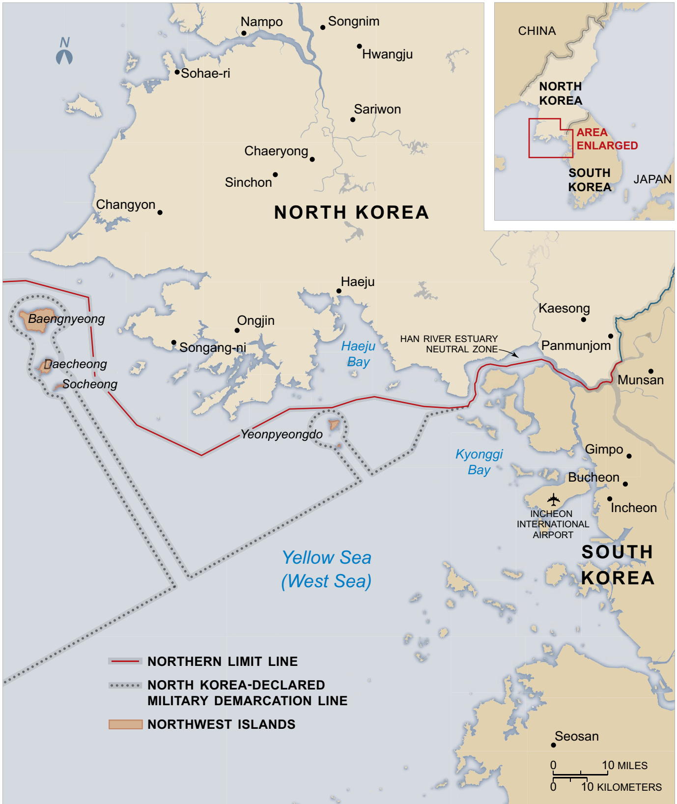
Map 2. Northern Limit Line