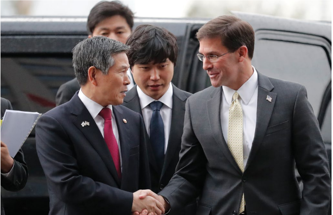
South Korean Defense Minister Jeong Kyeong-doo, left, greets US Defense Secretary Mike Esper as he arrives at the Security Consultative Meeting in Seoul on November 15, 2019.

through the Military Armistice Commission at the DMZ during the 1990s and 2000s—would also provide a regular forum for addressing strategic tension reduction measures, enhancing communication and transparency, and preventing miscalculations and accidents that could escalate into larger conflict. 108 A dialogue with the North Korean military could also help build a relationship with one of the most powerful constituencies within the regime, enhance its buy-in to the peace regime process, and strengthen US understanding of its interests and motivations.