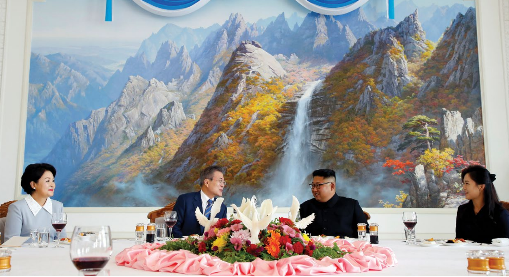
President Moon Jae-in of South Korea and Kim Jong Un of North Korea, flanked by their spouses, during a luncheon in Pyongyang during their September 2018 summit.