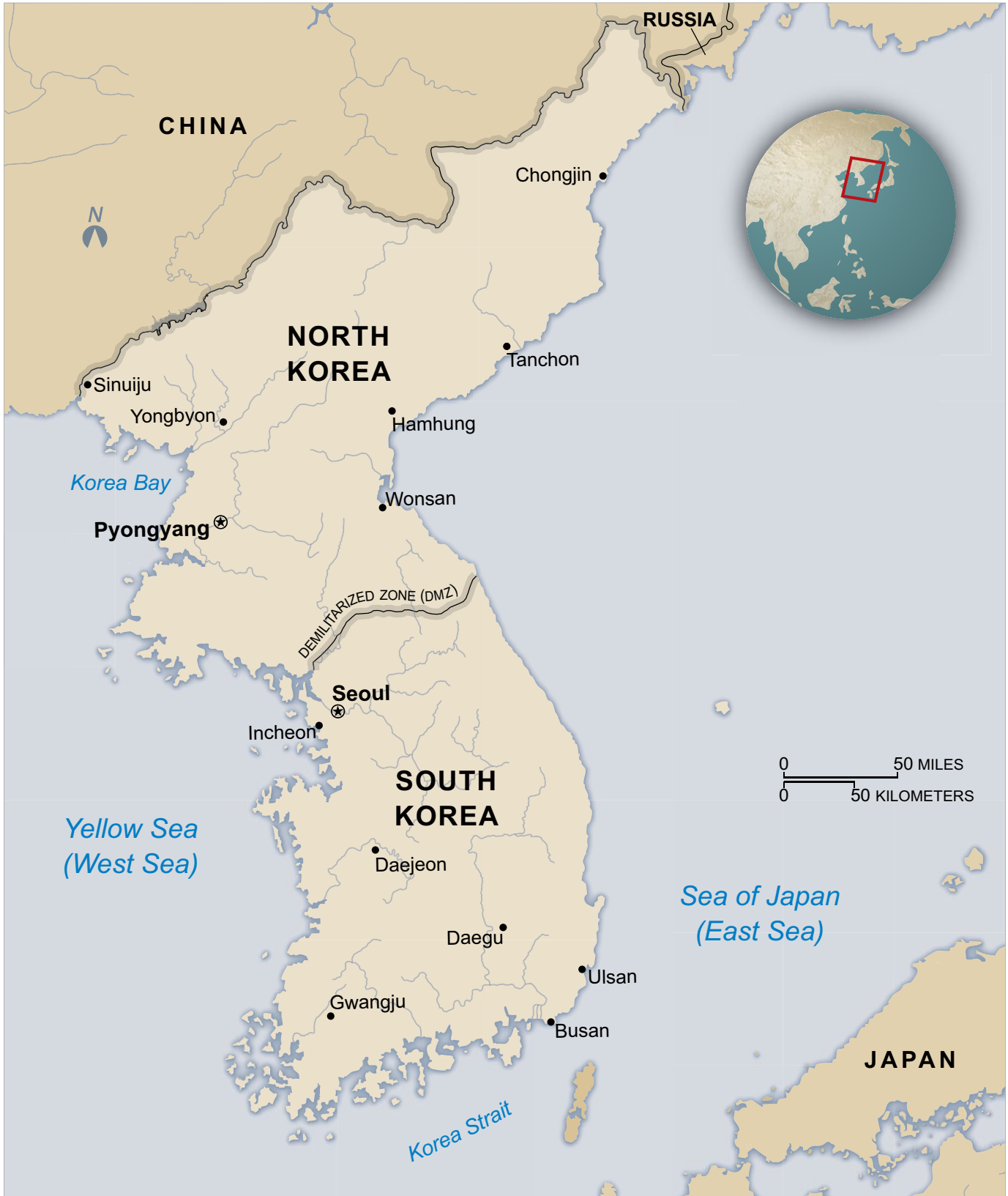
Map 1. The Korean Peninsula Artwork by Lucidity Information Design