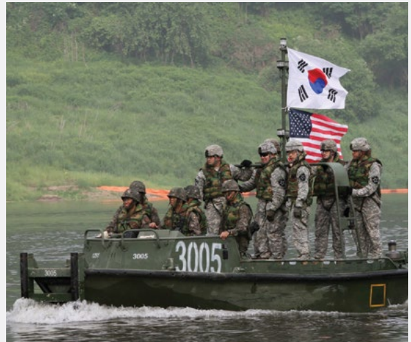
US and South Korean soldiers cross the Namhan River during a May 2013 joint military exercise in Yeoncheon near the border with North Korea.

The potential for improved US-DPRK relations and an eventual peace agreement would raise important questions about the future of the US military presence on the Korean Peninsula. Currently, the United States stations approximately 28,500 troops in South Korea, concentrated in two major hubs: Camp Humphreys, which is the largest US military base overseas and located fifty-five miles south of Seoul in Pyeongtaek, and a constellation of bases around the southeastern city of Daegu. This forward-deployed presence reflects not only the US treaty commitment to defend its ally but also the broader goals of projecting power and serving a stabilizing function in the region.