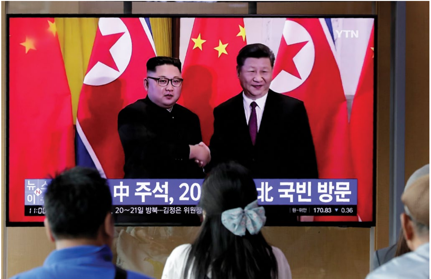
Commuters in the Seoul Railway Station watch a television showing North Korean leader Kim Jong Un, left, welcoming Chinese President Xi Jinping to Pyongyang on June 21, 2019.

Korean Peninsula beyond the strictly defensive terms enumerated in China’s bilateral treaty with North Korea. 26 Chinese leaders insist that China is a “new type of great power” uninterested in formal alliances. China has never extended its nuclear umbrella over another country thus far, and the provision of extended deterrence guarantees to North Korea or other partners would require a fundamental shift in China’s strategic thinking.