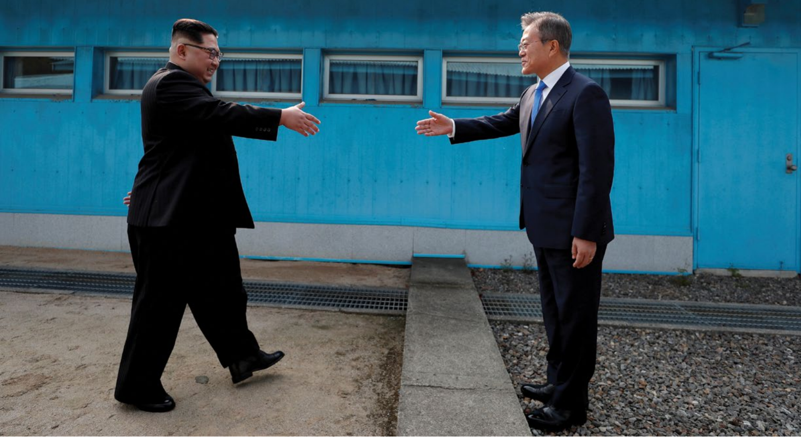
President Moon Jae-in of South Korea, right, and North Korea's leader, Kim Jong Un, shake hands in the truce village of Panmunjom on April 27, 2018. At center is the border between the two Koreas.