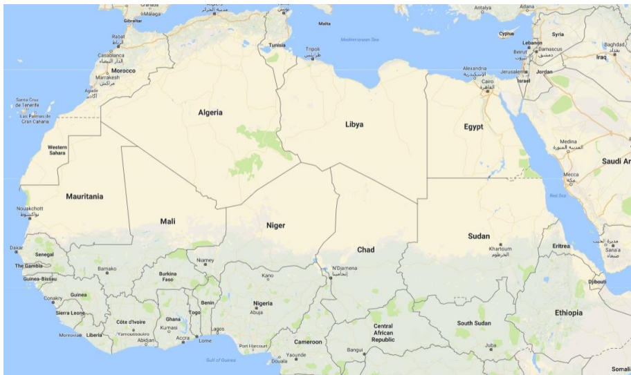
Figure 1: Map of North Africa and Sahel.

In some cases, the spread of IS into North Africa/Sahel was panned as a top-down strategy whereby the Caliphate has sent individuals to the region in order to establish territorial enclaves. In the majority of cases, however, the strategy has been that local groups have declared their loyalty to Baghdadi and in so doing have spontaneously chosen to affiliate themselves with IS. Concurrent to IS experiencing success on the battlefield, proclaiming the inception of the Caliphate and beginning to disseminate its violent propaganda videos, many militant IS groups in North Africa and Sahel have chosen to affiliate themselves with IS at their own initiative. However, this is mostly a case of complex, dynamic processes, whereby militant groups initially announce their support for IS and thereafter in some cases establish a more formal relationship with high-ranking IS emirs – if not outright official recognition from Baghdadi himself. Consistent with the fact that many foreign fighters from North Africa/Sahel have