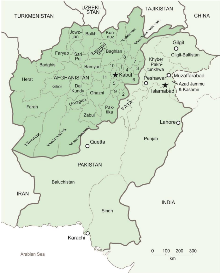
Figure 1: Map of Afghanistan and Pakistan.

Pakistani consulate in Jalalabad, the capital of Nangarhar. ISK has also been active in Pakistan, particularly with attacks in the Sindh province, and according to Pakistani news coverage, ISK has managed to gain supporters in the tribal areas of Pakistan (FATA), where the Pakistani Taliban still has its strongholds and where Al-Qaeda previously enjoyed widespread popularity and protection.