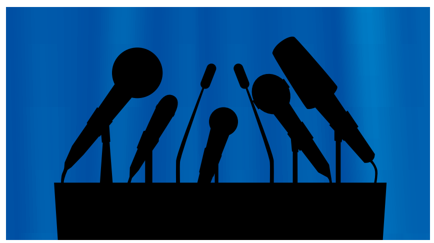
Risk communication has been neglected in security policy to date.

Risk communication between political decision-makers, public authorities, experts, and the general public is considered a central component in the official handling of complex and networked risks. So far, however, the concept has been applied almost exclusively in the context of technical and environmental risks. Harnessing risk communication for specific issues in foreign and security policy can sensitize the public to specific problems, create legitimacy for the actions of government agencies, and thus enhance the strategic capabilities of political actors in the case of a crisis.