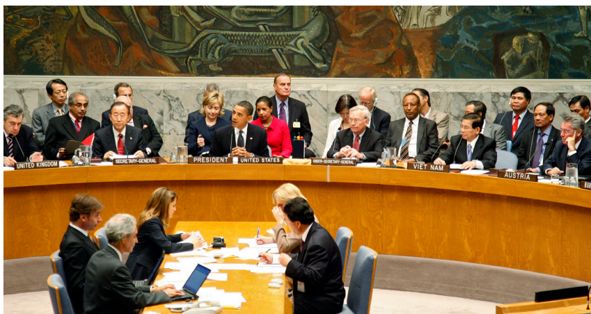
UN Security Council session on 24 September 2009 chaired by US President Barack Obama.

Efforts are underway to make the UN Security Council more representative, legitimate, and efficient. However, the reform project is blocked by disagreements, regional rivalries, and institutional obstacles. A loss of legitimacy is increasingly likely. Small and medium-sized states in particular have an interest in strengthening the UN's comprehensive multilateralism and thus pre-empting tendencies towards unilateralism or ad-hoc coalitions. Unblocking reform demands that all sides display willingness to compromise. It is important that the reform goals not be watered down in the process.