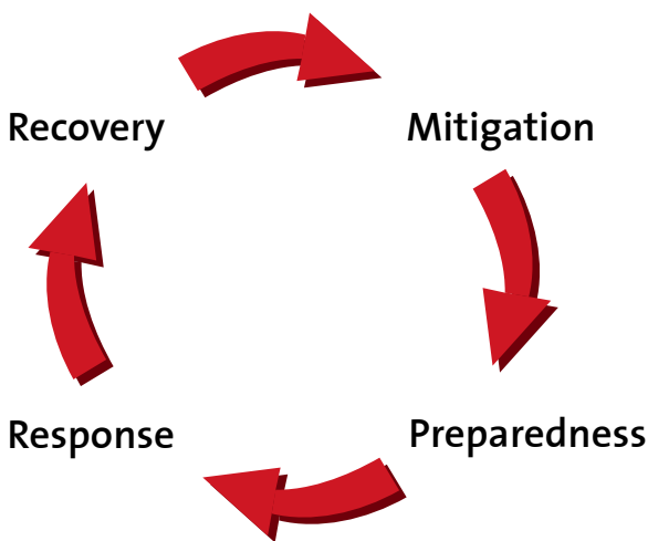
Figure 1: Resilience Cycle 10

As discussed thus far, all highly resilient systems possess the capacity to absorb major disturbances and reorganize while undergoing changes that allow them to retain their functionality and identity, or in other words, to maintain the essence of the system or societal unit. However, much like the concept of critical infrastructure, the concept of resilience is also evolving. As noted, states are increasingly coming to the understanding that the notion of protecting all critical infrastructures from threats – no matter what the cause – is unrealistic. Rather than focusing on the causes, efforts are underway to anticipate the consequences of CI breakdowns and damages.